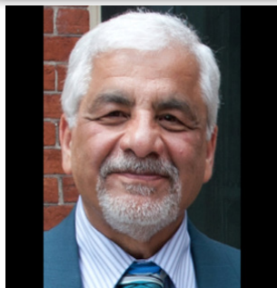
IEEE CTS Chairman